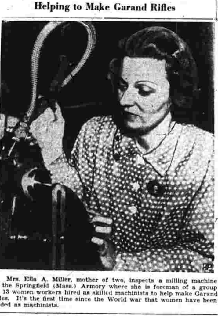
Helping to Make Garand Rifles

Reports of unabated Japanese military operations in the Pacific were reported today.